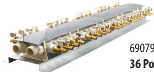
6907936CP 36 Port Manifold