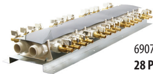
6907928CP 28 Port Manifold