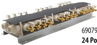
6907924CP 24 Port Manifold