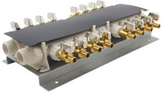
6907984CP 16 Port Manifold