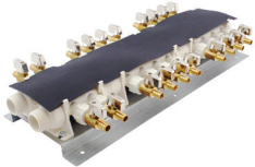
6907920CP 20 Port Manifold