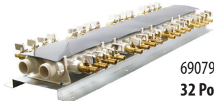
6907932CP 32 Port Manifold