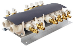
6907912CP 12 Port Manifold